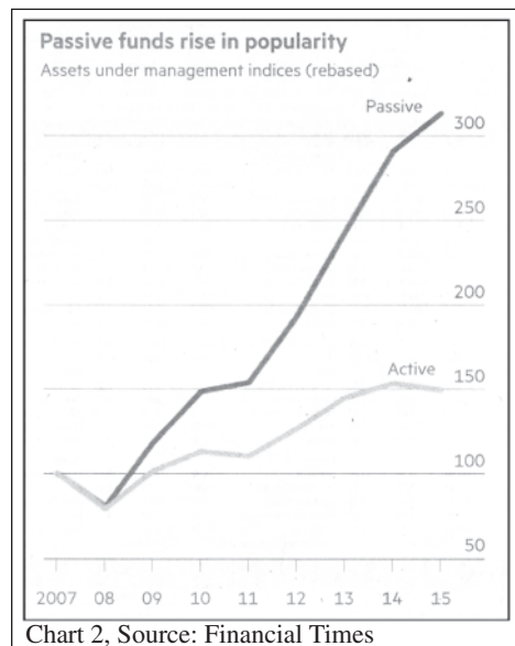
Chart 2, Source: Financial Times