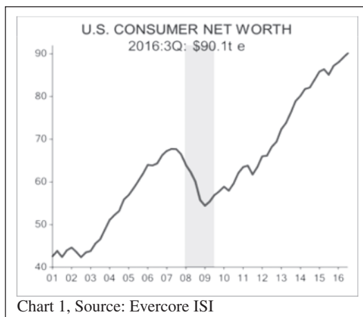
Chart 1, Source: Evercore ISI

We expect 2% 2016-17 GDP growth and a continuation of the 25 year trend of approximately 2% inflation. Our 2020 S&P 500 target is 3000 (vs. 2170 currently) based on $120+ EPS and a 20-25X valuation buttressed by an estimated $60 dividend. We prefer equities to fixed income investments to achieve our goal of improving portfolio purchasing power over this investment cycle.